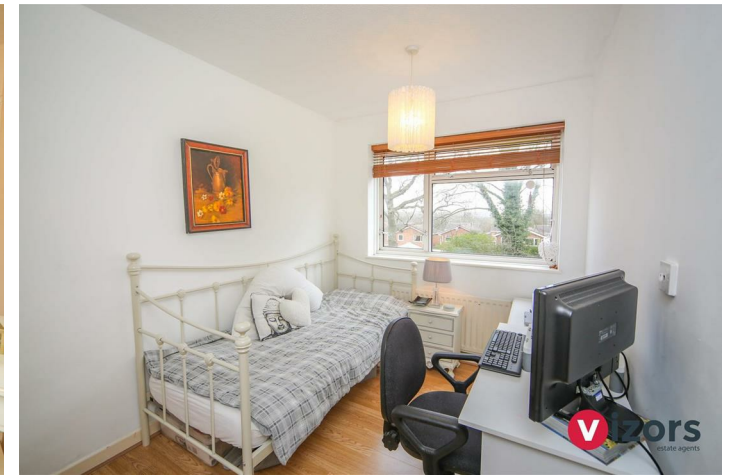
Bedroom 3 10'5" max x 7'10" max (3.20 max x 2.40 max)