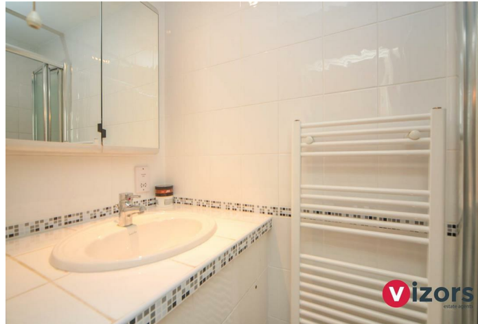
Bedroom 2 12'5" max x 7'6" max (3.80 max x 2.30 max)