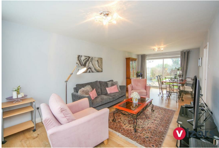
Kitchen 17'8" max x 11'9" max (5.40 max x 3.60 max)