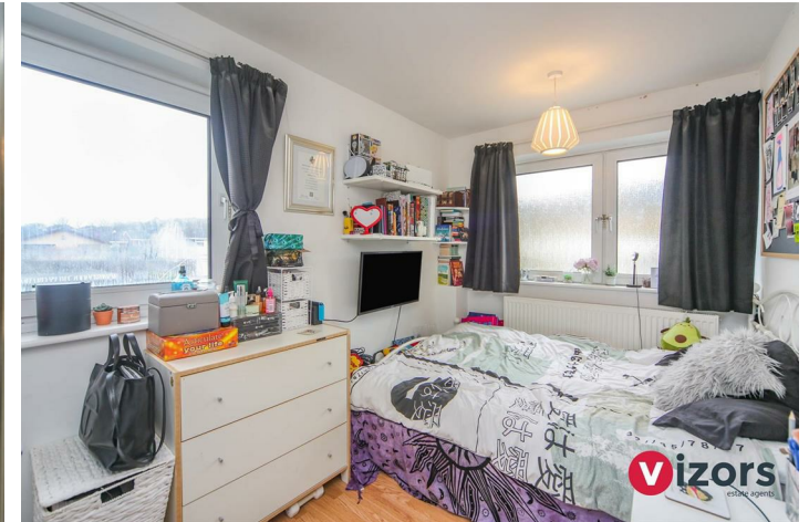
Bedroom 4 7'10" max x 7'6" max (2.40 max x 2.30 max)